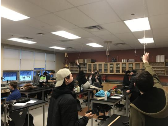
Physics in Action

Here are some photos of some of the events and learning that have taken place in the past month: