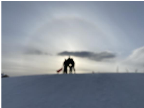
FLEX Students Surrounded by a Sundog