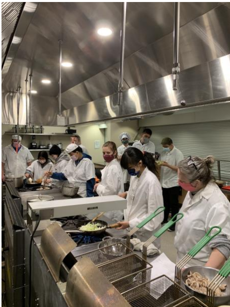
FLEX Students in the Kitchen