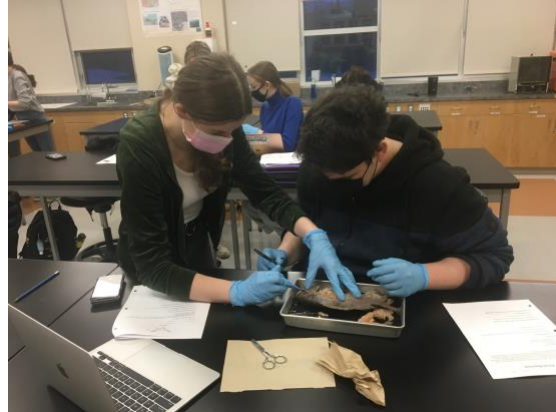
Life Sciences Dissections