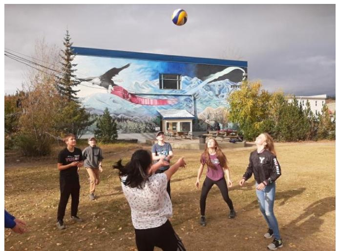
It's a bird, it's a plane, no it's a good time at Wood St.!

Contact me with any concerns or insights!