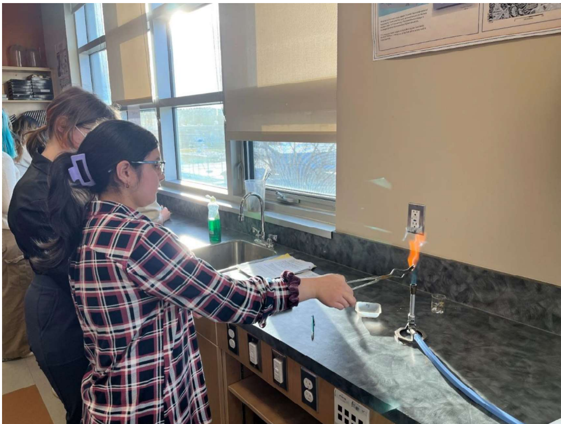
Grade 10 Science students conduct experiments

JANUARY EXAM & PROJECT SCHEDULE – SEE FHCOLLINS.CA