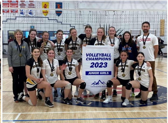
Grade 9/10 Volleyball men's and women's champions! Warrior Pride!