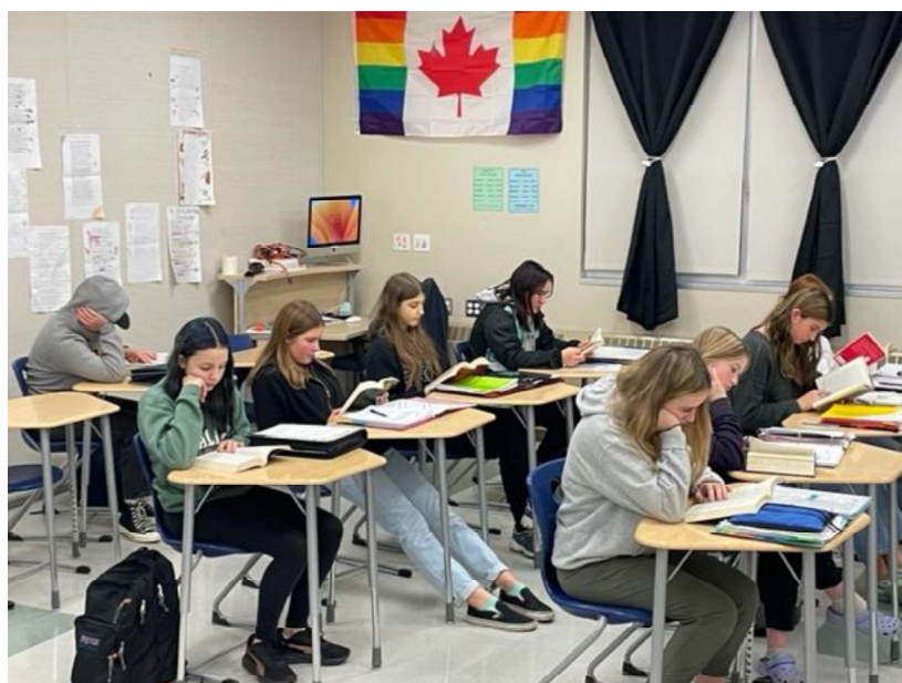
And still lots of good old-fashioned reading, writing and arithmetic happening at FHC!