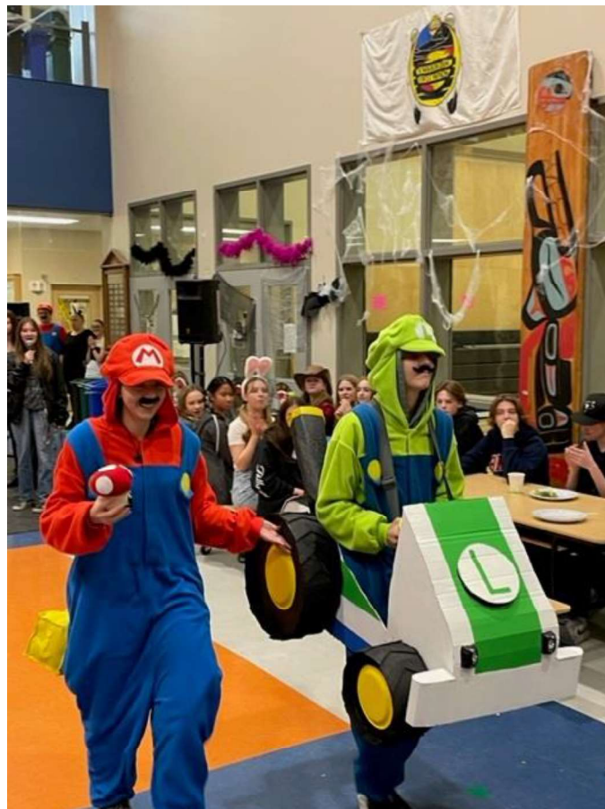
Go Go Mario...