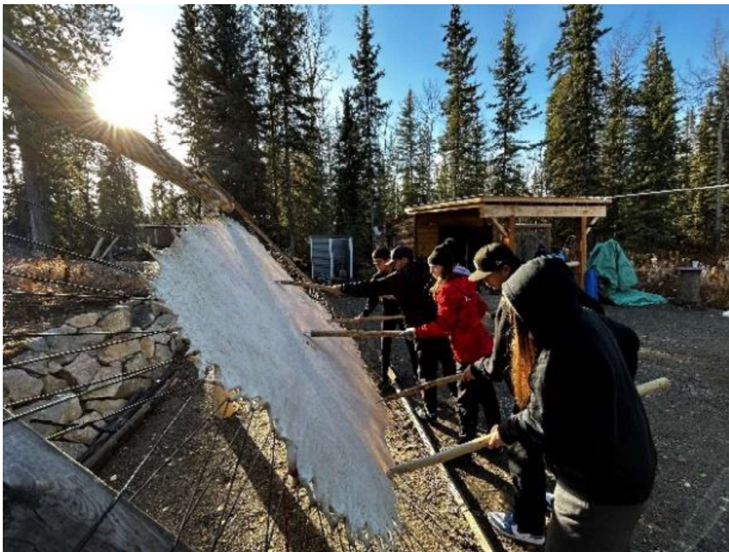
Indigenous Academy students scape hides

The Indigenous Academy program will be hosting a film night and silent auction on December 5th at the Beringia Centre to showcase a series of Indigenous films (including sharing our own). Doors will be open at 5:30pm and the silent auction last call will be at 8:00pm. We have received some incredible donations for our silent auction including handmade items, an Air North gift certificate and Arcteryx jacket. We will also have the honour of hearing from some of our Indigenous community leaders who were part of the films. All money raised will be split between the Yukon Aboriginal Women's Council and our program. This is shaping up to be an exciting night – all are welcome! See attached 'Film Night Poster'