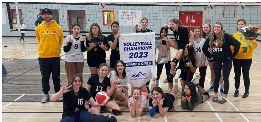
Grade 8 Girls Yukon Champions! Warrior Pride!